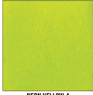
NEON YELLOW 4 (flame retardant)