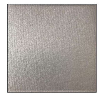
FR 9 (flame retardant)

Store in a cool and dry place; protect against the influence of light when stored. We recommend not to exceed a storage period of 12 months. The technical specifications rest on extensive tests and technical research. Due to the variety of possible influences during refinement, and use, the specifications should be viewed as reference values. We recommend a suitability test on the original material. A legally binding warranty of specific characteristics cannot be derived from our specifications.